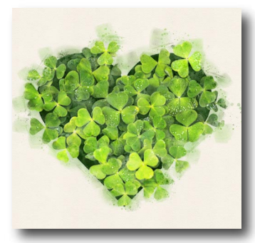
Shamrock Art Project