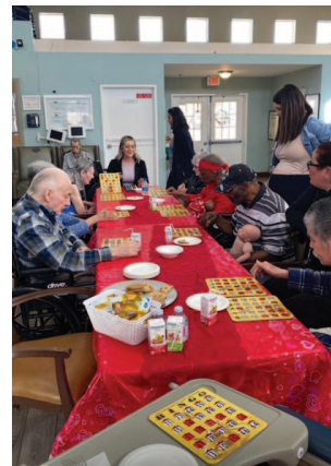
March 2024 - 3